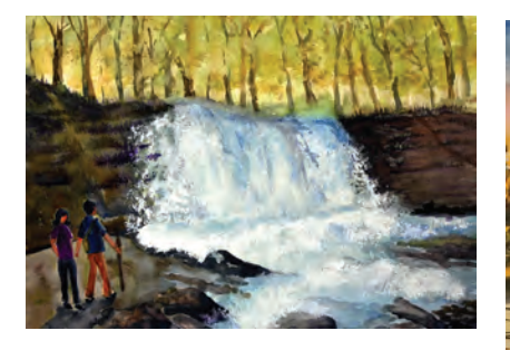
Sunset Over Lake Tiogue