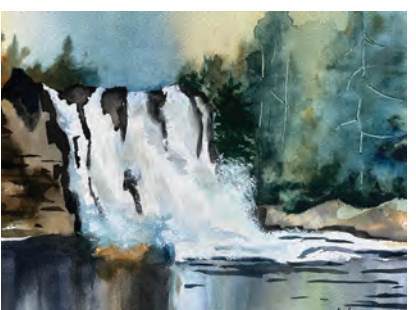
Cascading and Calm