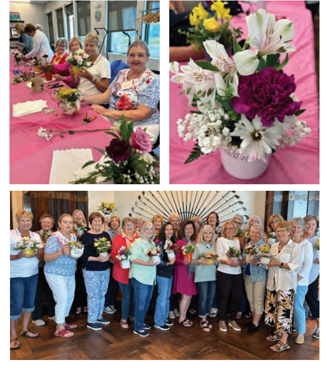
Photos above are from our May meeting making arrangements for a local assisted living home.