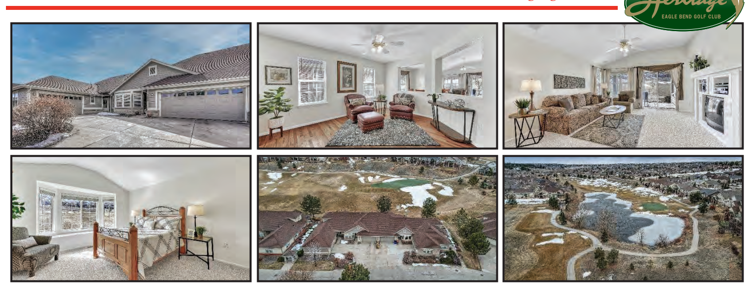
904 on the 5<sup>th</sup> Green – Only 2 days on the market – Listed for $500,000 - http://7683SBiloxiWay.com/ HEB: Where the Fun Begins & Doesn't End! Our services include staging, aerial photography & property website