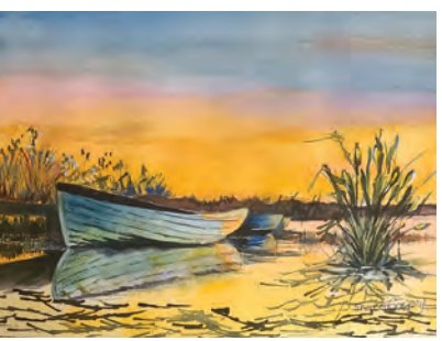
Docked at Sunset