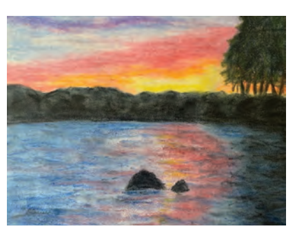
Sunset Over Lake Tiogue