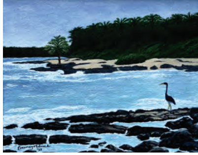
Playa del Carmen