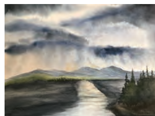
Another Storm Headed Our Way