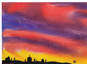
Sunset on the Front Range